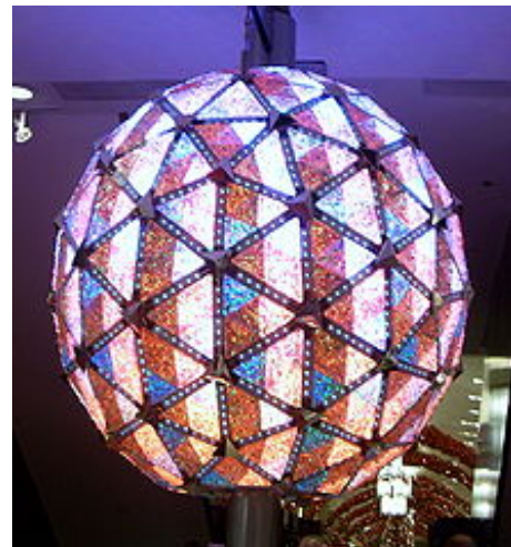
The ball dropping in Times Square on New Year's Eve.

Well, sometimes resolutions just do not work out, but they are still fun! Nonetheless, Cloverleaf has clearly thought of some unique and interesting New Year's resolutions.