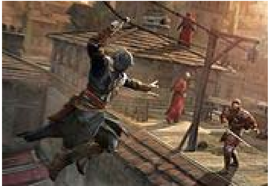
A screenshot of the game.

Revelations' multi-layered narrative mostly focuses once again on Ezio Auditore, embarking on a