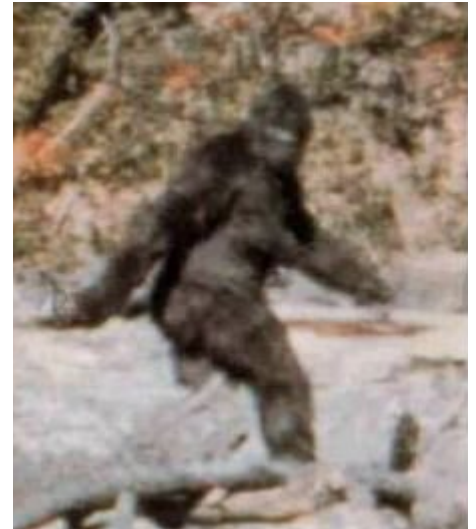
A very common photo that many avid believers use to prove the existence of Bigfoot.

Skeptics usually point to misidentification of other animals as the main reason for the sightings. Many people believe they are seeing a Bigfoot, when really they are witnessing a bear or other wild animal. Also, many people claim to have seen Big-